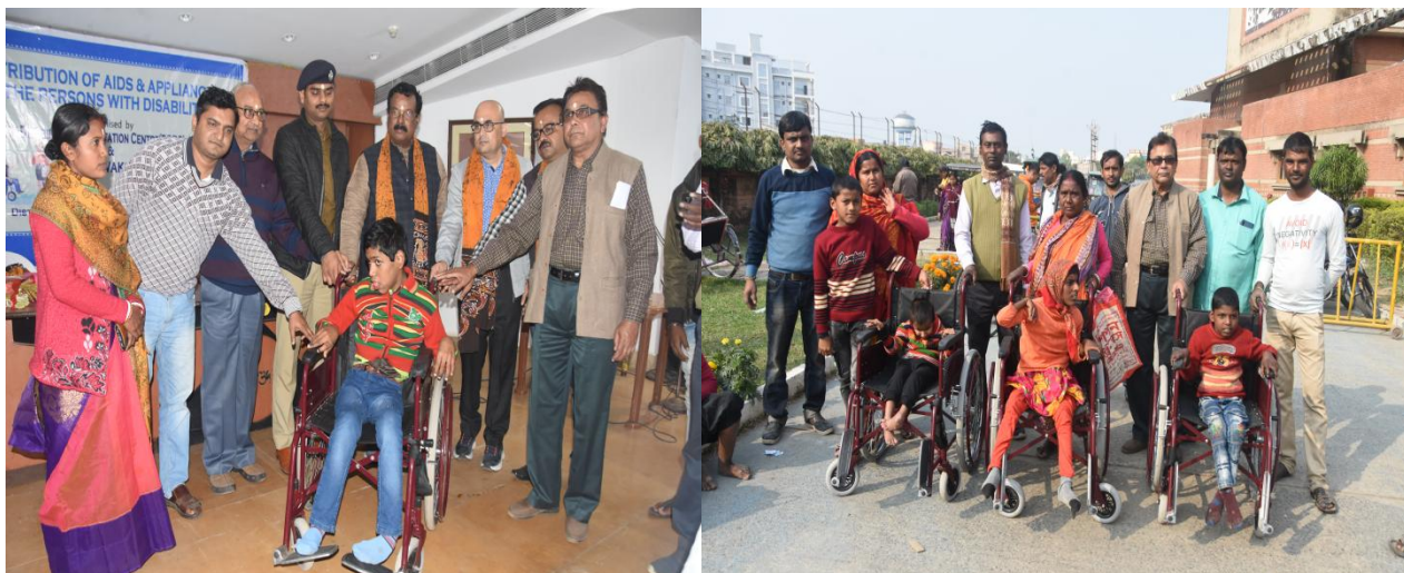
Aids & appliances distribution programme for the Persons with Disabilities organized at Gitanjali Auditorium, Bolpur, Birbhum on 29/12/2022

Details of aids and appliances Distributed at Labpur&Bolpur Block during this F/Y 2022- 2023: