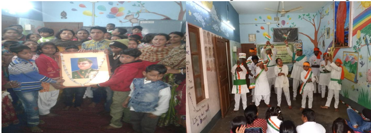
Celebration of Netaji Subhash Chandra Bose Birth Day at SEVAKS, Ratanpally, Santiniketan, Birbhum on 23 rd January 2023.