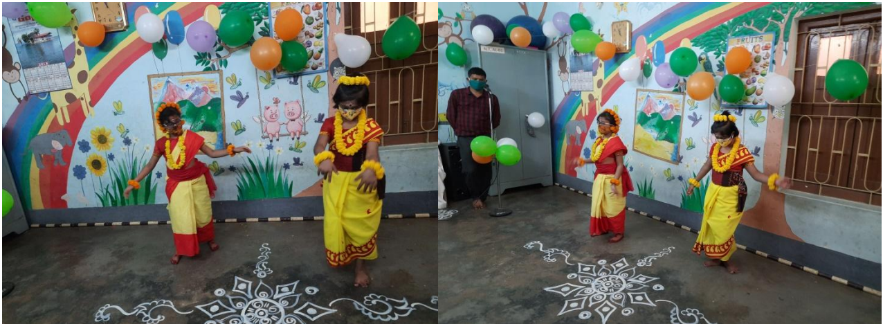
Children's Day celebrated on 14 th November 2022 at SEVAKS Special School at Ratanpally, Santiniketan.

Children's Day celebrated on 14 th November 2022 at SEVAKS Special School at Ratanpally, Santiniketan, Birbhum. The teacher of SEVAKS explains the importance of the Day. The children of Special School performed different cultural program on the above occasion. At the end of the programme refreshment were given to all children of this programme.