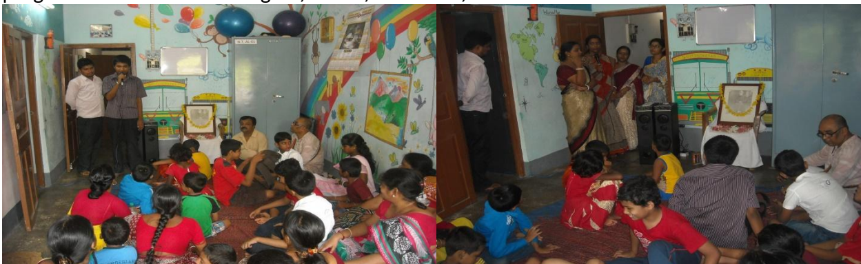
Rabindra Jayanti Celebrated at SEVAKS, Ratanpally, Santiniketan, Birbhum, West Bengal on 9 th May 2022.

Rabindra Jayanti is an annual cultural festival at Rabindranath Tagor's University at Visva Bharati, Santiniketan. SEVAKS also celebrated Rabindra Jayanti on 9 th May, 2022 i.e. 25 th Day of Baisakh in remembrance of the great Indian Poet scholar, Novelist etc. The dignitaries and parents of PwDsexplained the importance of the Day as well as the Biography of Rabindranath Tagore. The great poet contribution in English & Bengali Literature and about Kabiguru's Nobel Prize "Gitanjali" also explained. Children as well as the guardian performed different cultural programme like Rabindrasangeet, dance, recitation, sit & draw etc.