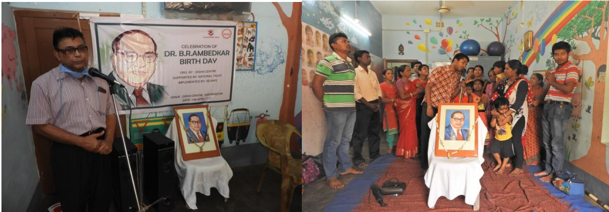
Celebration of B.R. Ambedkar Birthday at SEVAKS, Santiniketan, Birbhum on 14.04.2022.