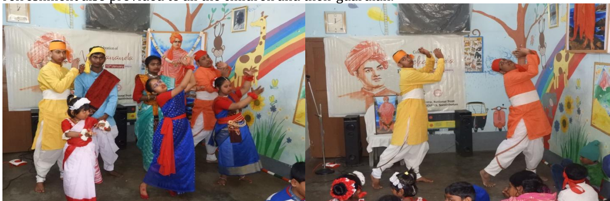
Celebration of Vivekananda Birth Day at SEVAKS Special School, Ratanpally, Santiniketan, Birbhum on 12 th January 2023.