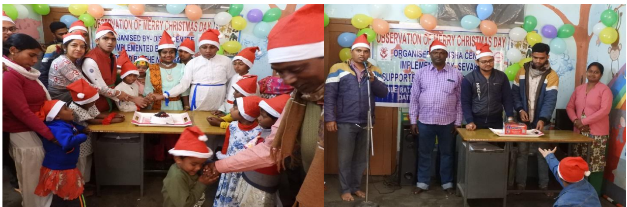
Merry Christmas Day observed on 25 th December 2022 at SEVAKS Special School, at Ratanpally, Santiniketan.

Merry Christmas Day was celebrated on 25 th December 2022 at SEVAKS Special School. The importance of the day was explained by the staff of Special School. The children of Special School performed different cultural programme on this Day. Christmas Cake distributed to all the children and guardians at the end of the programme.