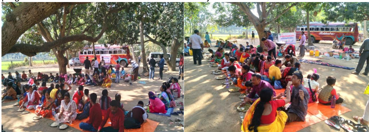
Tour & Picnic of Children with Special Needs of Special School at Sabujbon, Panswoa, Bolpur, Birbhum on 12.02.2023.

SEVAKS organized tour and Picnic for the children with Special Needs of Special School on 12.02.2022. Total 58 children and their guardian participated in this tour & Picnic programme at Sabujbon, Panswoa, Bolpur, Birbhum. All children are happy and enjoy a lot in this programme. The Children also visited the Park at Sabujbon.