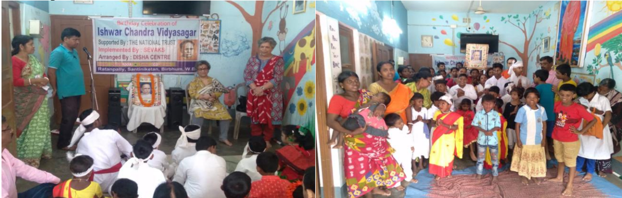
Birth day of Iswar Chandra Vidyasagar observed on 26 th September 2022 at SEVAKS Special school Ratanpally, Santiniketan, Birbhum.

Birth day of Iswar Chandra Vidyasagar observed on 26 th September 2022 at SEVAKS Special School Ratanpally, Santiniketan, Birbhum. The Teacher and other staff of Special School explained the importance of the Day. Various cultural programme were performed by the children as well as guardian. At the end of the programme refreshment were distributed to all the student and guardian of the Special school.