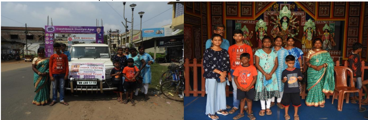
Durga Puja Porikroma with the children of Special School and visit different Durga Murti and decorated Pandels at Bolpur, Birbhum on 1 st October 2022.

Durga Puja is big festival in West Bengal from 1 st October to 5 th October. SEVAKS had taken an initiative to visit the different Durga Murti & decorated pandal with the children of Special school. Durga Puja Porikromawith the children of Special School and visit different Durga Murti and decorated Pandels at Bolpur, Birbhum was organized on 1 st October 2022.