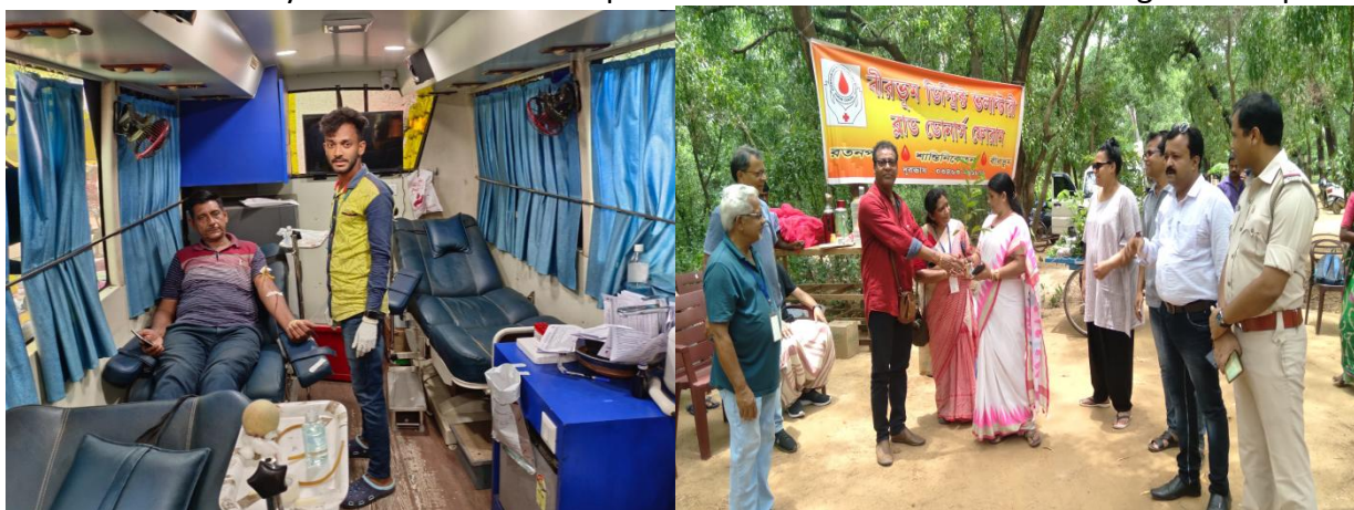
Voluntary blood donation camporganised at Sonajhuri Hat, Santiniketan, Birbhum on 26/6/2022