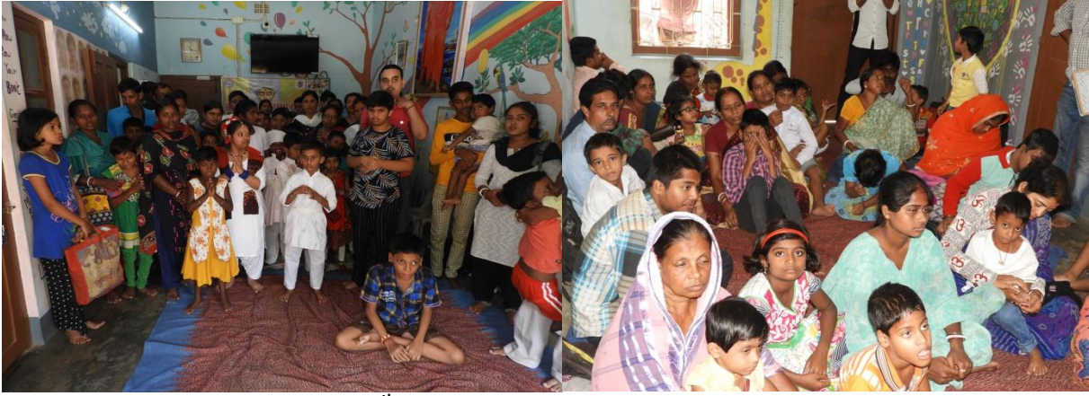
Celebration BijoyaSammiloni on 16 th October 2022 at SEVAKS office premises, Ratanpally, Santiniketan, Birbhum.