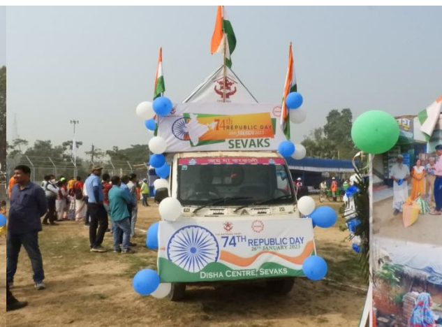
Tableau on Prevention of Disability of SEVAKS on the occasion of Republic day celebration at Bolpur Sub-Divisional Govt. programme on 26.01.2023 at BolpurDukbanglowmaidan, Birbhum.