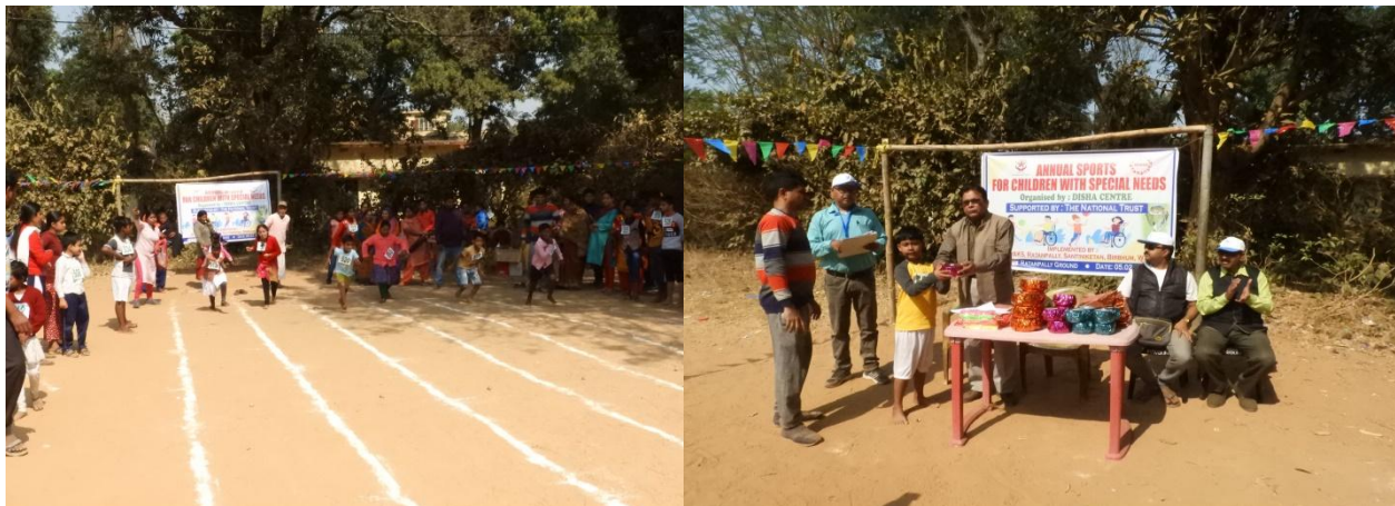
SEVAKS organised an Annual Sports for Special School students on 5 th February, 2023 at Ratanpally Ground.