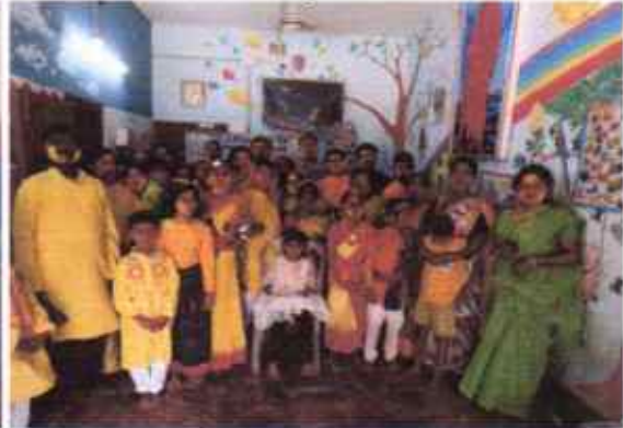
Basanta Utsav was celebrated at Disha Centre on 18 th March 2022 at Ratanpally, Santiniketan, Birbhum.

World Down Syndrome Day was observed at Disha Centre on 21 st March 2022. The Special Educator explains the cause and how to overcome the Down Syndrome with the guardian and parents of the Special Child. At the end of the programme sweets were given to all the children and guardian.