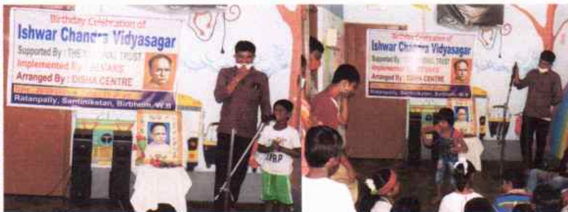
Birthday celebration of Iswar Chandra Vidyasagar on 26 th September 2021 at Disha Centre Ratanpally, Santiniketan, Birbhum.

Iswar Chandra Vidyasagar birthday celebration on 26 th September 2021 at Disha Centre Ratanpally, Santiniketan, Birbhum, West Bengal. The Special Educator and other staff of Disha Centre explained the importance of the day. Various cultural programme were performed by the children as well as guardian. At the end of the programme refreshment were distributed to all the student and guardian of the Disha Centre.