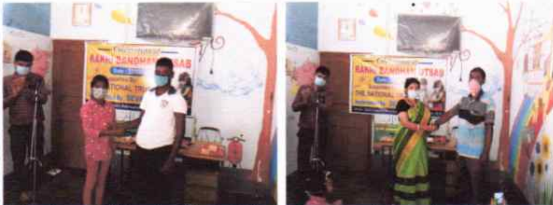
Celebration of Rakhi Bandhan Utsab at Disha Centre, Ratanpally, Santiniketan, Birbhum on 22 nd August 2021.