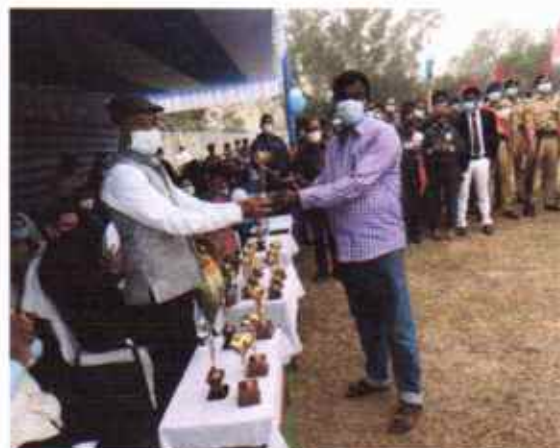
Tableau on Disability of SEVAKS on the occasion of Republic day celebration at Bolpur Sub-Divisional programme on 26.01.2022 at Bolpur Dukbanglow maidan, Birbhum.