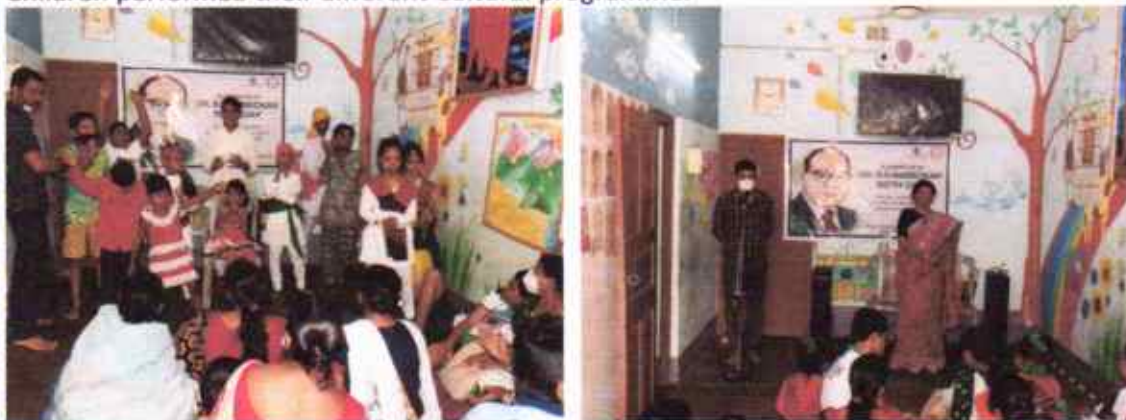
Celebration of Dr. B.R. Ambedkar Birthday at Disha Centre in Santiniketan, Birbhum on 14 th April 2021.

centre are explained the importance of the Day as well as biography of Dr. B.R. Ambedkar. Children performed their different Cultural programme.