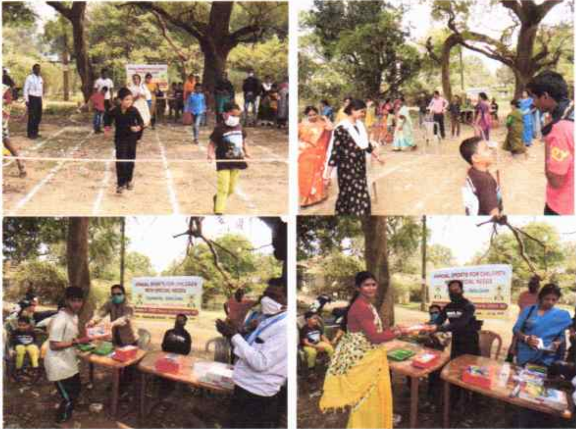
SEVAKS organised an Annual Sports for Disha students on 20 th February, 2022 at Ratanpally Ground, Santiniketan, Birbhum.