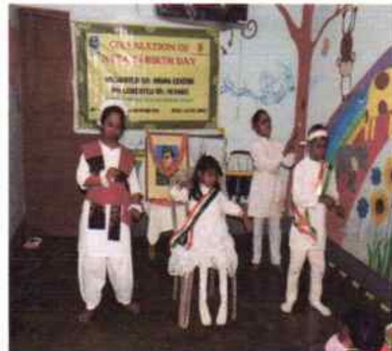
Celebration of Netaji Subhash Chandra Bose birthday at Disha Centre, Ratanpally, Santiniketan, Birbhum on 23 rd January 2022.