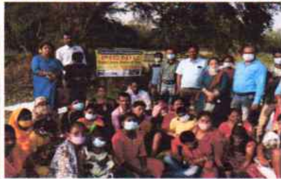
Tour & Picnic of Children with Special Needs of Disha Centre at Dhanuktala Math, Goalpara, Bolpur, Birbhum on 23.02.2022.

Basanta Utsab was celebrated at the Disha Centre on 18 th March 2022 at Ratanpally, Santiniketan, Birbhum. The Children performed different cultural programme on this occasion. Rang (Abir) wax also distributed to all the children of the Disha students. At the end of the programme sweets were given to all the children and guardian.