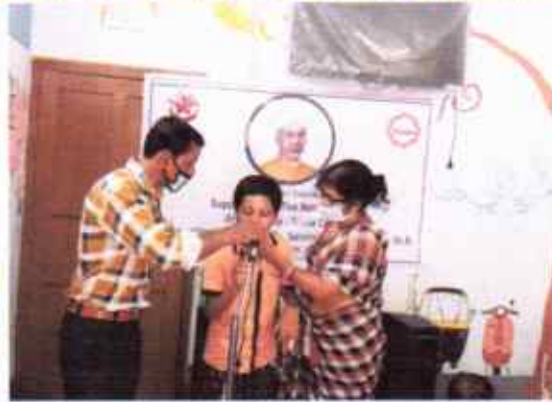
Celebration of Teachers Day at Disha Centre Ratanpally Santiniketan, Birbhum on 5 th September 2021.