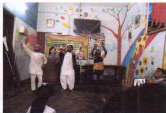
Celebration of World Down Syndrome Day at Disha Centre 21 st March 2022.