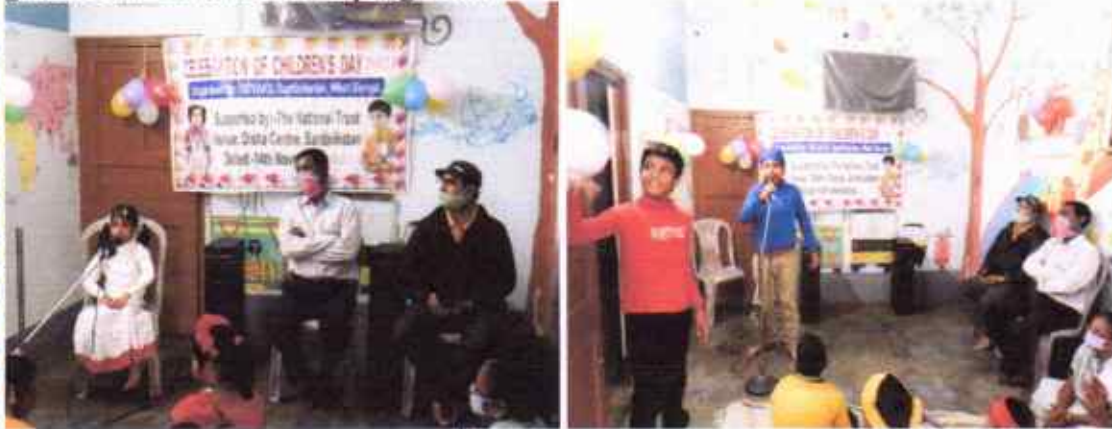
Children's Day was celebrated on 14 th November 2021 at Disha Centre at Ratanpally, Santiniketan, Birbhum.

Children's Day was celebrated on 14 th November 2021 at Disha Centre, Ratanpally, Santiniketan, Birbhum. The Special Educator of the Disha Centre explains the importance of the Day. The PwDs of the Disha Centre performed different cultural programme on the above occasion. At the end of the programme refreshment were given to all children of this programme.