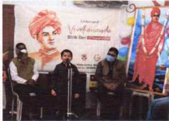
Celebration of Vivekananda Birth Day at SEVAKS Disha Centre, Ratanpally, Santiniketan, Birbhum on 12 th January 2022.