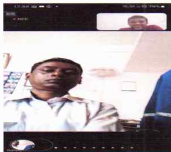
Rabindra Jayanti Celebrated at Disha Centre, Ratanpally Santiniketan, Birbhum, West Bengal on 9 th May 2021 through virtual mode.