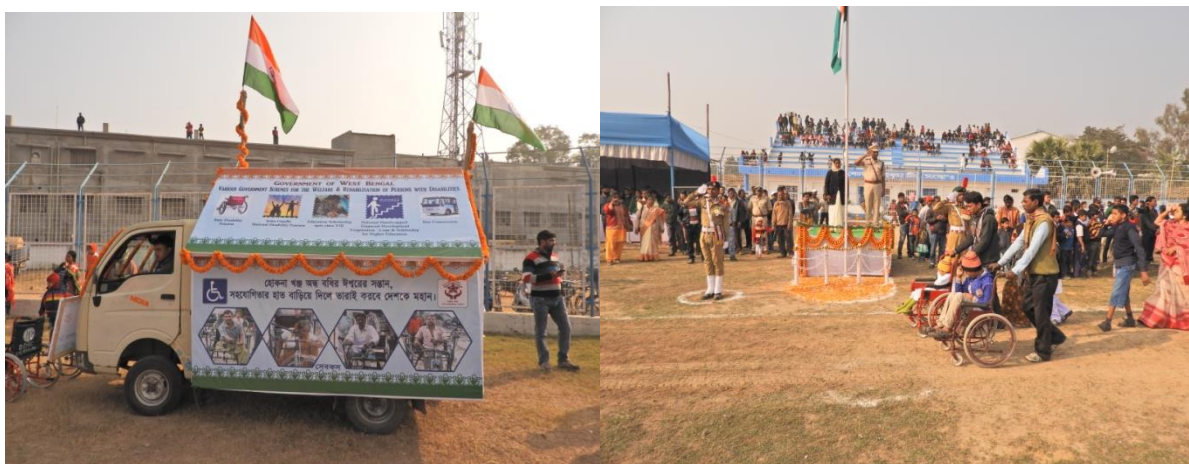
Tableau on Disability of SEVAKS on the occasion of Republic day celebration at Bolpur Sub-Division on 26.01.2018 at Bolpur Duckbanglow Maidan, Birbhum.