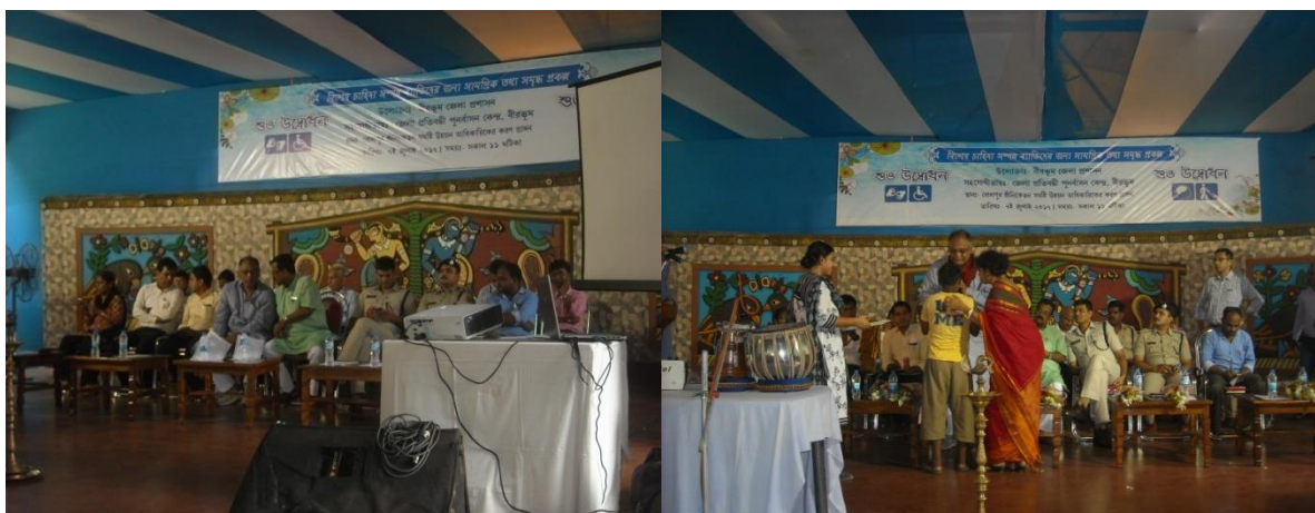
Hon'ble MIC Dept. of Fisheries Govt. of West Bengal and Hon'ble Sabhadhipati Birbhum Zilla Parishad Inaugurated "AGRANI" Software for Persons with Disabilities on 07.7.2017 at Bolpur Block.