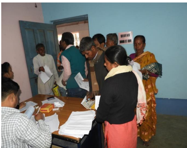
Screening camp for aids & appliances held on 29.11.2017 at Sainthia Block, Birbhum.