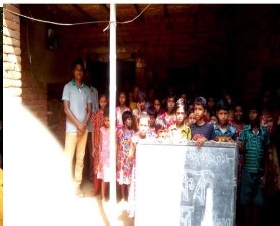
Child Labour students of Bilkandi Child Labour School under Nalhati – I Block is celebrating Teachers Day on 5 th September 2017.