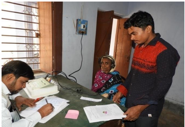
Screening camp for aids & appliances held on 28/11/2017 at Suri-I Block, Birbhum .

Screening camp for aids & appliances was organised on 29 th November 2017 at Sainthia Block premises, Birbhum in collaboration with National Institute of Locomotors Disabilities(NILD), Kolkata and District Administration Birbhum. The Camp was inaugurated by Sabhapati, Sainthia Panchayet Samity BDO, Sainthia Block in presence of DSWO, Birbhum, DCPO, Birbhum and many other dignitaries.