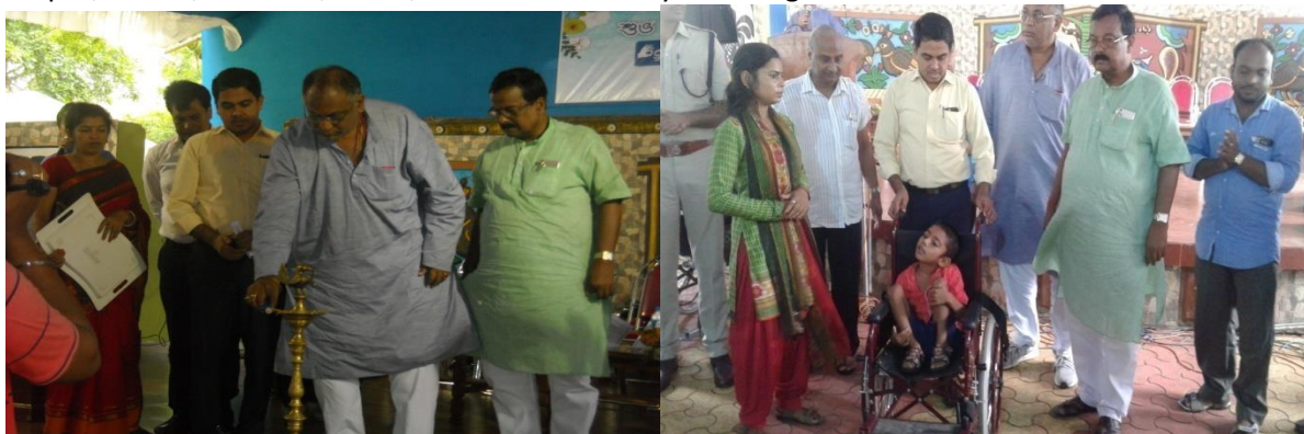
Hon'ble MIC, Dept. of Fisheries, Govt. of West Bengal inaugurated "AGRANI" Software for Persons with Disability on 07.07.2017 at Bolpur Block and the District Magistrate Birbhum handed over a Wheel Chair to a Cerebral Palsy Child on the same day.