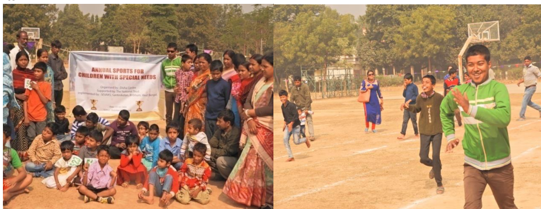
SEVAKS organised an Annual Sports for the Children with Special Needs on 3 rd February, 2018 at Ratanpally Ground, Santiniketan.

DDRC, Birbhum organised an Annual Sports for the Children with Special Needs on 3 rd February, 2018 at Ratanpally Ground, Santiniketan. Total 37 Children with Special Needs were participated in the Annual Sports in different vents like 50/100 meters run, spoon race, cricket ball throw & musical Chair. The Hony. Secretary DDRC, Birbhum handed over the prizes to 1 st , 2 nd & 3 rd position holders and consolation prizes were also handed over to all the participants in the Annual Sports.