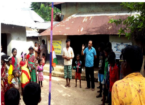
Child Labour Students of Jarkadanga Child Labour School under Bolpur Block is celebrating Republic Day Programme on 15 th August 2017.