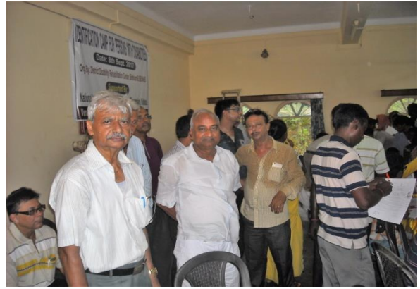
Screening camp for aids & appliances held on 8 th September 2017 at Bolpur, Birbhum.

Screening camp for aids & appliances was organised on 28 th November 2017 at Suri-I Block premises Birbhum in collaboration with National Institute of Locomotors Disabilities(NILD), Kolkata and District Administration Birbhum. The Camp was inaugurated by BDO, Suri-I Block and DSWO Birbhum in presence DCPO, Birbhum representative of NILD Kolkata & many other dignitaries.