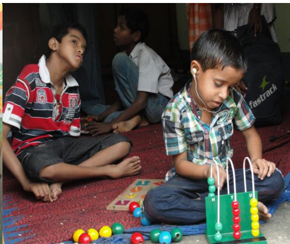
Children with Special Needs are in the DISHA Centre at Santiniketan..