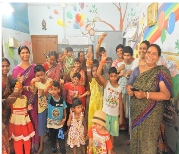
The Children with Special Needs are celebrating Rahi Bandhan Dibash at DISHA 07.8.2017.

DISHA CENTRE under the National Trust, Govt. of India has been implemented by SEVAKS at Ratanpally, Santiniketan, Birbhum since April 2016 for the Children of Mentally Retarded(MR), Hearing Impaired (HI) In this centre Special Educators, Physiotherapist Speech Therapist, Counsellor, Recreational Instructor and Care Giver are engaged for the education, development and rehabilitation of the Children with Special Needs. Total 22 Children with Special Needs are enrolled in this centre. This centre is running in five days in a Week. and Wednesday & Thursday is the holyday. SEVAKS also provided free transportation to the Children with Special Needs from their residence to attend the centre at Ratanapally, Santiniketan, Various activities were under taken through out from this centre the development of the Special Child. Light refreshment also provided to the Children with Special Needs,