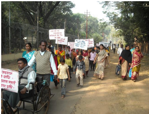
Mass Awareness Rally on the occasion of World Disabled Day on 03.12.09 at Santiniketan, Birbhum.

The function came to an end with the prize giving ceremony in the afternoon. The parents & guardians of the participators gave away the prizes making an earnest request to us so that we may stretch our helping hands to these disabled children and care them as our own brothers and sisters or sons and daughters.