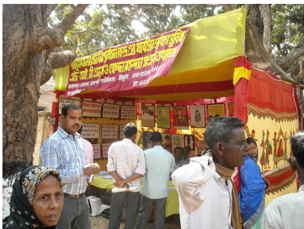
Mass Awareness & Information Stall on the facilities provided by DDRC, Birbhum including HIV/AIDS & Voluntary Blood Donation at Khujutipara, Nanoor, Birbhum from 13.02.10 to 14.02.10.