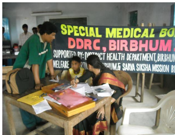
The Clinical Psychologist of DDRC, Birbhum have assessing the Mentally Challenged Children at the Special Medical Board held at the Office of the BDO, Paikar, Murarai-II Block on 19.02.10.