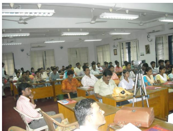
Participants of the Sensitisation-cum-Motivational Workshop on VBD at the Conference Hall of SDO, Bolpur on 12.09.09.