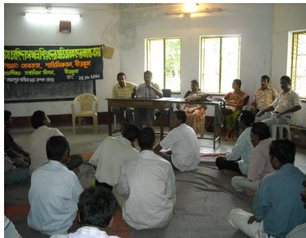
Guardians' Meeting under IED Programme at Bopur West CLRC, Sriniketan, Birbhum on 25.08.09.