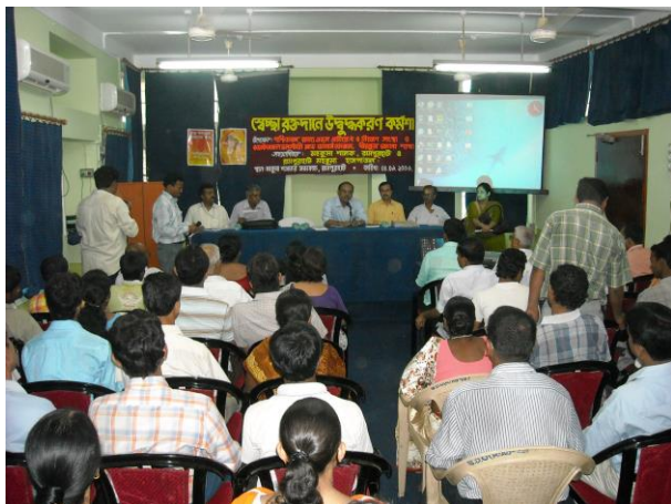
Sensitisation-cum-Motivational Workshop on Voluntary Blood Donation at the Conference Hall of SDO, Rampurhat on 04.09.09.