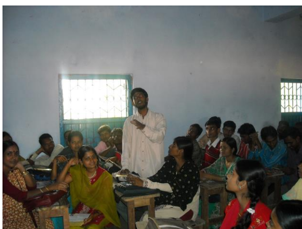
Question-Answer session of the Seminar-cum-Workshop on Voluntary Blood Donation at Kabi Joydeb College, Illambazar on 10.11.09.

Through these seminar-cum-workshops, we have provided the participators consisting of the entire students along with the members of RRC of the colleges with the true knowledge of preventing the dreadful disease of HIV/AIDS including the way of making changes the behavioural attitude in an individual towards leading good quality of life. Beside that an initiation is taken to