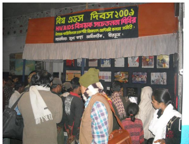
Video shows on HIV/AIDS are watching by the general public including the Railway passengers at the Mass Awareness Stall at Bolpur Railway Station from 01.12.09 to 03.12.09