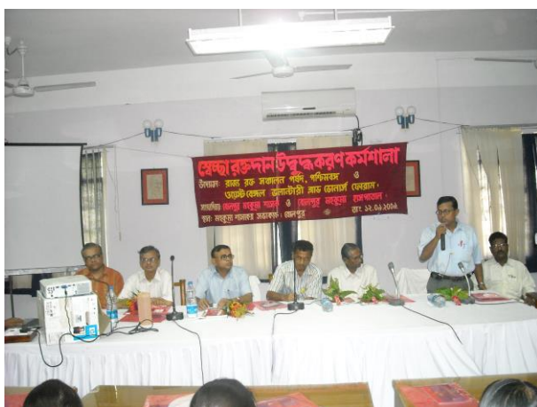
Sensitisation-cum-Motivational Workshop on VBD at the Conference Hall of SDO, Bolpur on 12.09.09.