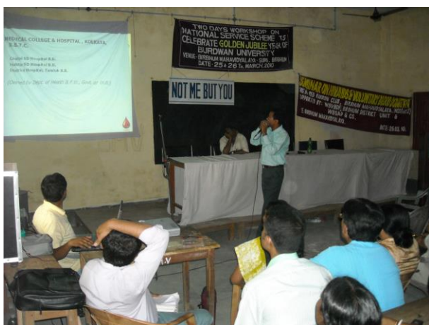
Seminar-cum-Workshop on Voluntary Blood Donation at Birbhum Mahavidyalaya, Suri on 26.03.10.