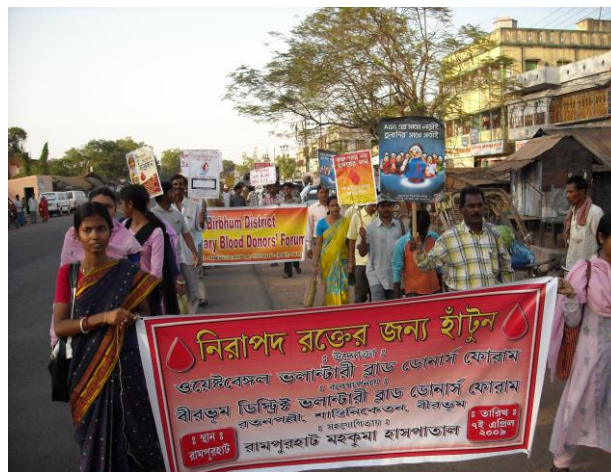
The Mass Awareness Rally "Walk for Safe Blood" at Rampurhat Sub-Divisional Town on 07.04.09.