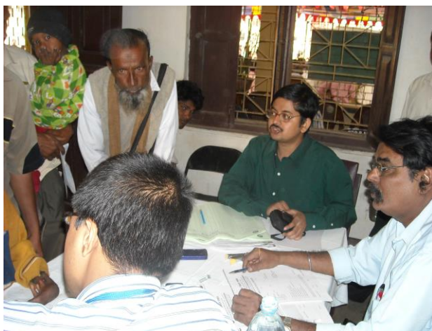
Identification Camp for the Persons With Disabilities of all category at Suri Police Line Hospital on 12.02.10.

During the year 2009-2010 several Camps were organised for the disabled persons of all category at Birbhum for providing them with necessary Aids & Appliances. More than, 700 Persons With Disability were assessed through these camps. On 12 th February 2010 an Identification Camp was held at Suri Police Line Hospital in support of National Institute for Orthopaedically Handicapped for providing Aids & Appliances to the Persons With Disabilities under all ages and having any type of Disability of Suri Sadar Sub-Divisional Area by the experienced medical experts and technicians of the concerned fields. More than 435 Disabled Persons under different disabled category were assessed by the technical experts of concerned field through this Identification Camp. The Identified Persons were recommended with various types of Aids & Appliances and assistive devices according to their needs.