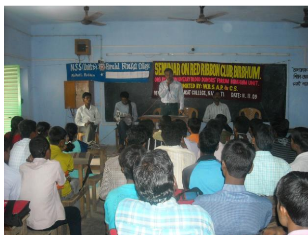
Seminar-cum-Workshop on Voluntary Blood Donation at Hiralal Bhakat College, Nalhati on 11.11.09.