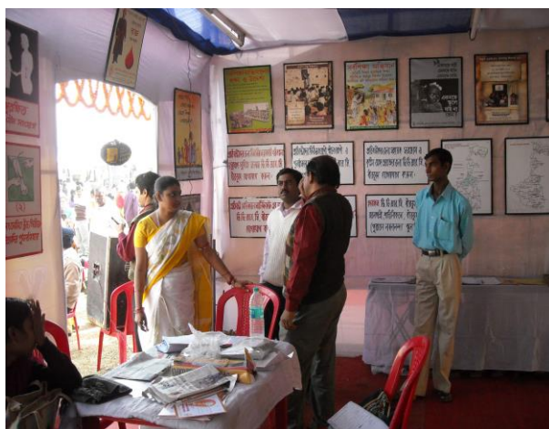
Written messages and posters on Disability at the Mass Awareness Stall at Santiniketan Poush Mela Festival from 23.12.09 to 26.12.09.