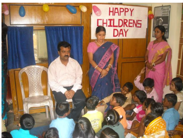
Observation of Children's Day 2009 with the Children With Spl. Needs at Ratanpally, Santiniketan, Birbhum.