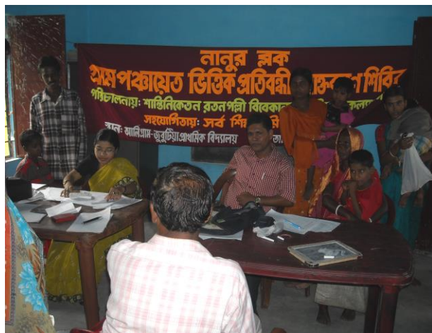
Gram Panchayat Level Assessment Camp for Disabled Children at Aligram-Jubutia Primary School, Nanor Block on 19.08.09.

In every year several Assessment Camps for Disabled Children are organised by SEVAKS in the seven blocks of Birbhum district in support of Sarva Siksha Mission, Birbhum. Through these camps the present status including the degree of disability of the disabled children are detected and the support service, Aids & Appliances and IEDC benefits are recommended to them according to their needs. In the year 2009-2010 during the month of August we have organised Gram Panchayat Level Assessment Camps in each Circle of the seven block through which total 807 Children With Special Needs were assessed and recommended with Aids & Appliances and other benefits. From the very beginning of this programme up to March 2010 total 3475 disabled children has so far been assessed through these camps, but on the other hand, it cannot be denied that a good number of disabled children are still out of the scene. However, our organisation is firmly determined to bring all the non-assessed disabled children of the seven blocks under this assessment programme within the following years.