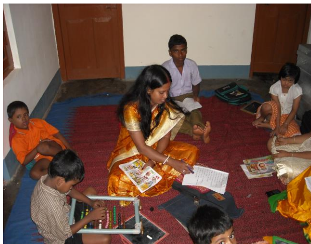
Disabled Children are getting education in the homely atmosphere of Navodyam Sikshaniketan at Ratanpally, Santiniketan, Birbhum.