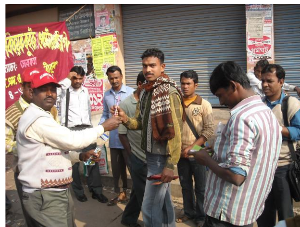
Spot Quiz Competition on HIV/AIDS at Kirnagar, Birbhum on the occasion of World AIDS Day 2009.