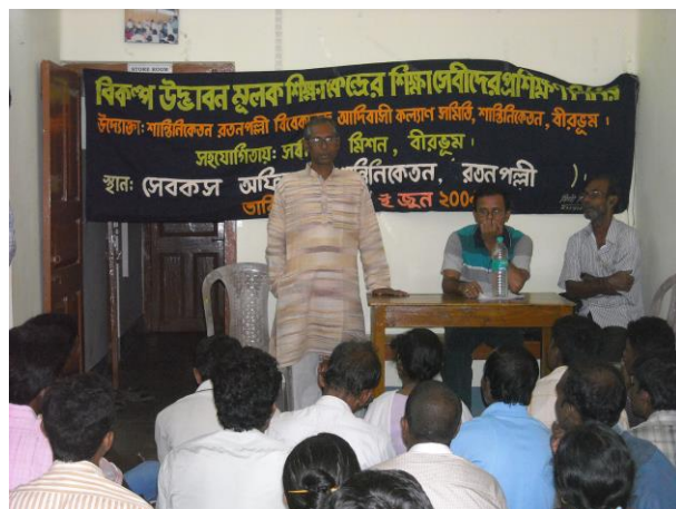
Training Programme for the Siksha Sebis at the Premises of SEVAKS at Ratanpally, Santiniketan, Birbhum on 15.06.09 & 16.06.09.