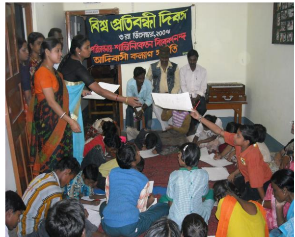
Sit & Draw competition for Disabled Children on this occasion at SEVAKS, Sanitniketan, Birbhum