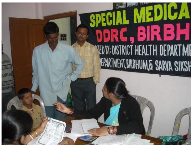
The Clinical Psychologist of DDRC, Birbhum have assessing the Mentally Challenged Children at the Special Medical Board held at DDRC, Birbhum on 21.12.09.