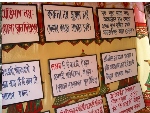
Written messages and posters on Disability at the Mass Awareness Information Stall at Khujutipara, Nanoor, Birbhum from 13.02.10 to 14.02.10.