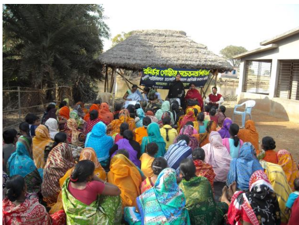
Awareness Programme on formulation & Nurturing of SHGs at Dharampur, Illambazar Block on 03.02.10