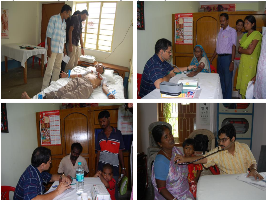
General people are getting free Health Check-up facility at the Multipurpose Health Checkup Camp.