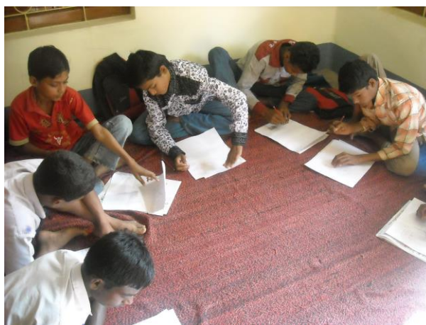
Sit & Draw competition for Children With Special Needs at Ratanpally, Santiniketan, Birbhum.