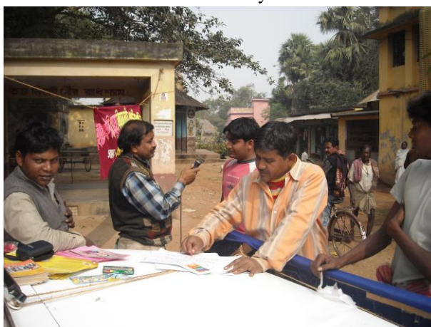
Poster Drawing Competition on HIV/AIDS at Bahiri, Birbhum on the occasion of World AIDS Day 2009.