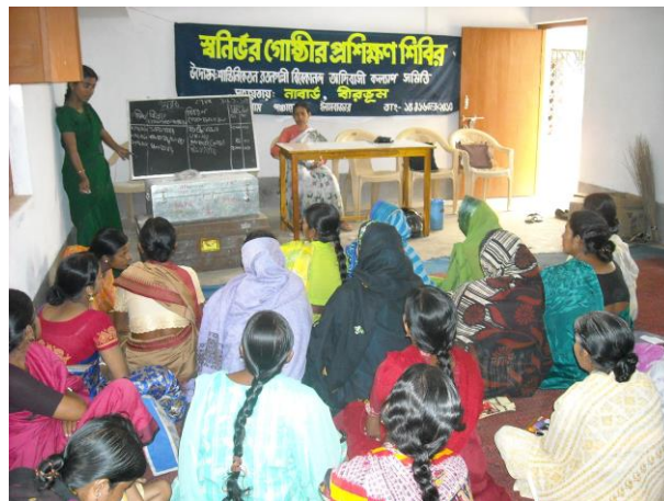
Leaders' Training Programme for the members of Self Help Groups at Nanasol from 15.02.10 to 18.02.10