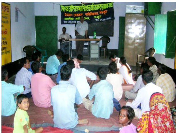
Guardians' Meeting under IED Programme at Nanoor CLRC, Basapara, Birbhum on 17.08.09.

Under this programme the Children With Special Needs are enjoying a healthy educational environment, as a good number of (nearly 3000) disabled children are admitted in formal schools of respective blocks of Birbhum district since last seven years and therefore getting education along with the other non-disabled children. Out of them a considerable number of disabled children have completed their primary level education. Beside that after the implementation of programme strategy misbelieves and superstitious concerning disability is gradually vanishing from the general mind.