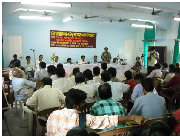
Sensitisation-cum-Motivational Workshop on VBD at the Conference Hall of ACMOH-III, Birbhum at Suri on 11.09.09.