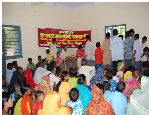
Gram Panchayat Level Assessment Camp for Disabled Children at Panchshowa Junior Basic School, Bolpur Block on 22.08.09.