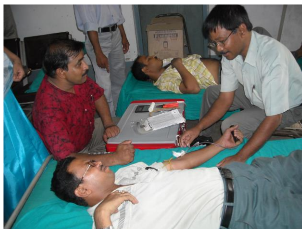
Activities of Voluntary Blood Donation at Rotary Bhavan, Bolpur on the occasion of World Thalassaemia Day 2009