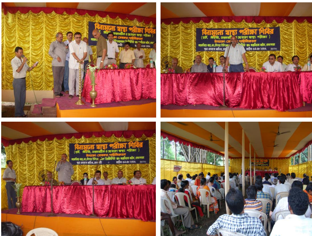
Inauguration of Multipurpose Health Checkup Camp at Ratanpalli, Santiniketan, Birbhum on 09.08.09

Through this Multipurpose Health Check-up Camp total three hundred and forty five patients having Heart, Kidney and Diabetic problem has took the free medical advice of the specialist Doctors and undergone free medical test.