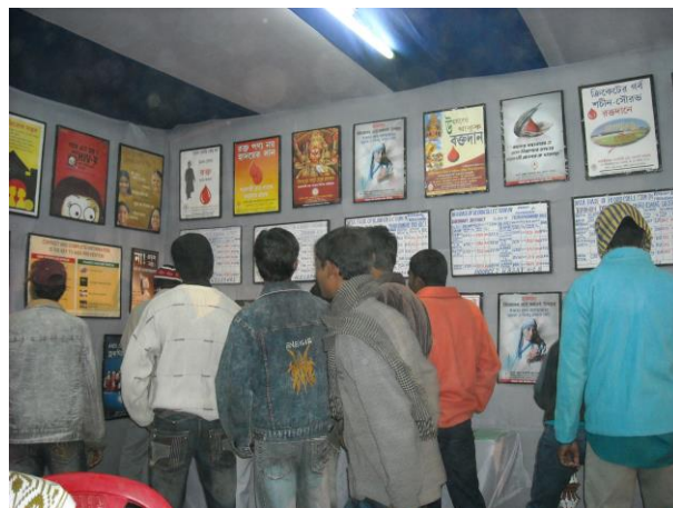
Mass Awareness Stall at Santiniketan Poush Mela from 23.12.09 to 26.12.09.