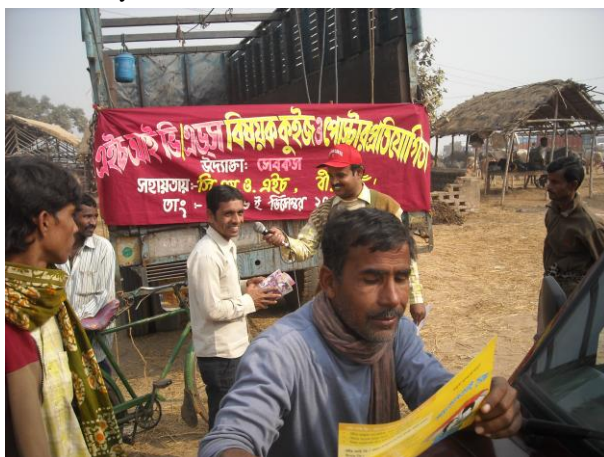
Spot Quiz competition & IEC distribution on HIV/AIDS at Illambazar Cattle Market, Birbhum on the occasion of World AIDS Day 2009.