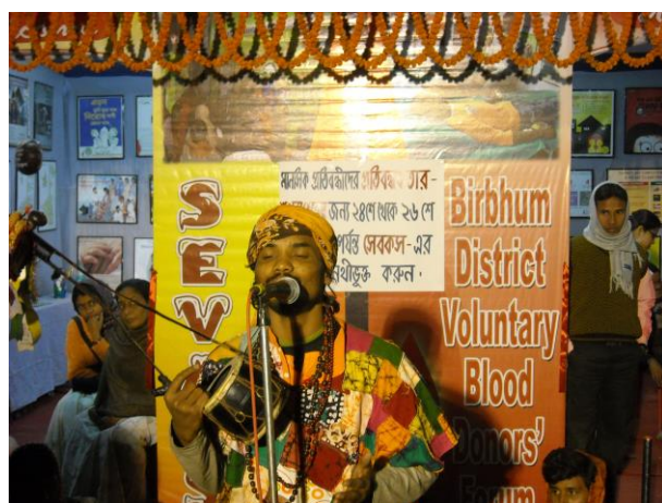
Baul Songs on Voluntary Blood Donation at the Mass Awareness Stall at Poush Mela.

To appraise the general public, flying sex workers, truck drivers on the objectives of our stall and about the knowledge of Voluntary Blood Donation, HIV/AIDS and Thalassaemia through local folk (Baul) song on the subject was arranged. More than 10000 people were educated from this cultural programme. Many people came to the stall and asked questions and encouraged us to conduct such type of activities in every fair.