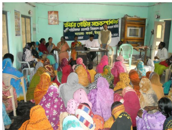
Awareness Programme on formulation & Nurturing of SHGs at Nanasol, Illambazar Block on 03.02.10