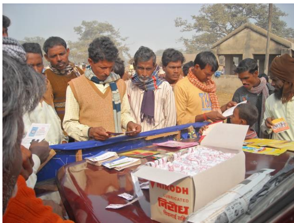
Special Campaign Programme on HIV/AIDS at Illambazar Cattle Market, Birbhum on the occasion of World AIDS Day 2009.