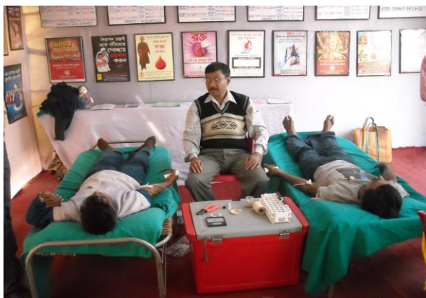
Voluntary Blood Donation Camp in support of Bolpur Sub-Divisional Hospital Blood Bank on 25.12.09 at Poush Mela Stall.