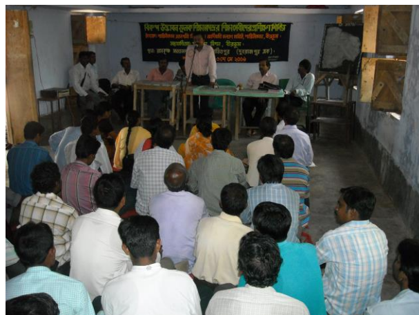
Training Programme for the Siksha Sebis at Panditpur Ramkrishna Satyananda Ashram at Dubrajpur on 22.05.09 & 23.05.09.