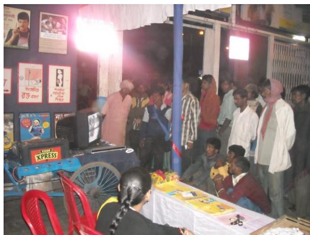
Video shows on HIV/AIDS are watching by Taxi drivers, Kulis, Rickshaw Pullers, labourers at the Mass Awareness Stall at Bolpur Railway Station from 01.12.09 to 03.12.09

Next, at the Mass Awareness Stall an important programme was undertaken in order to aware general mass through video shows on HIV/AIDS as a major part of the occasion, which draw a special attraction among the Rickshaw pullers, Kuli, Auto and Taxi drivers of Bolpur Railway Station. This video show programme was arranged at the stall during three days of the programme at 8.00 p.m. for two hours. It is important to note that most of the viewers of this show were the rickshaw pullers and taxi drivers who like to enjoy such type of programme very much. It is to be noted that the occupational groups like taxi drivers, rickshaw pullers, labourers are high-risk group in the town. Some time the sex workers are used in the rail line side in night. Therefore, we think that the video show is very important programme to the viewers. More than 200 people enjoyed the show.