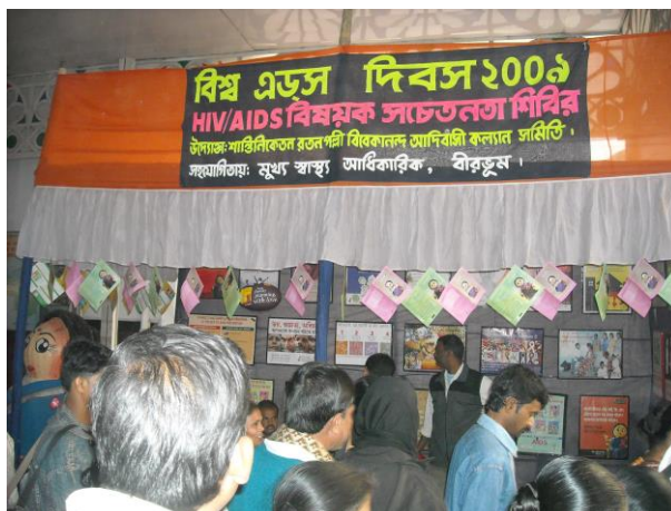
The Mass Awareness Stall on HIV/AIDS on the occasion of World AIDS Day 2009 at Bolpur Railway Station from 01.12.09 to 03.12.09.